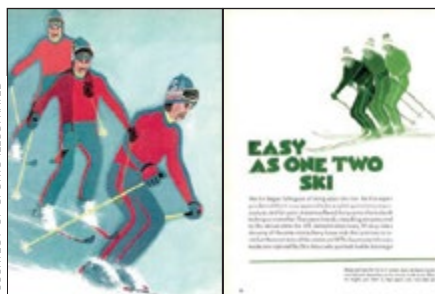
The “American Technique” unveiled at the 1975 Interski was featured in Sports Illustrated .

For the past six decades, each generation has dedicated itself to a better understanding of our relevance as the leading snowsports education association in America. This was evident when the U.S. Demonstration Team caused a sensation with its debut of the “American Technique” at the 1975 Interski