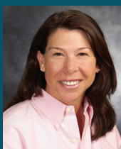
Diann Roffe Olympic Gold Medalist