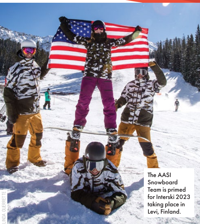
The AASI Snowboard Team is primed for Interski 2023 taking place in Levi, Finland.