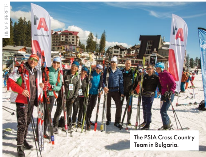
The PSIA Cross Country Team in Bulgaria.